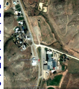
Centerville School Aerial

The festival will be held at the Centerville School at 693 Stockett Rd, Sand Coulee MT. We will have a full double gym with a wooden floor for your toe-tapping pleasure! There will be showers and dressing rooms for our convenience. We plan to have the coolest vendors around for your purchasing pleasure. RV'ers that come to our event will have dry camping right across the roadway from the event.